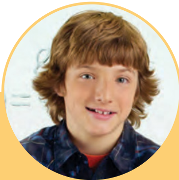
Jake Short Star of Disney Sitcom A. N. T. Farm (Quimbly)