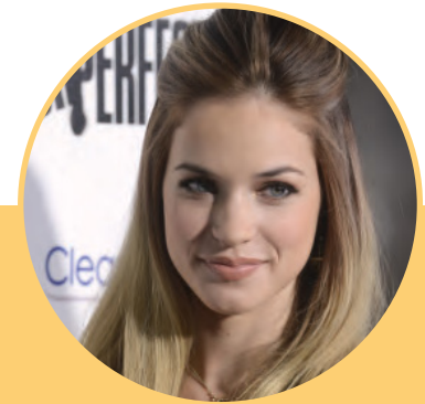
Alexys Knapp Pitch Perfect