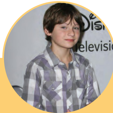
Jared Gilmore Once Upon A Time on ABC Sunday Nights