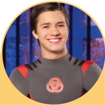
Billy Unger Lab Rats on Disney